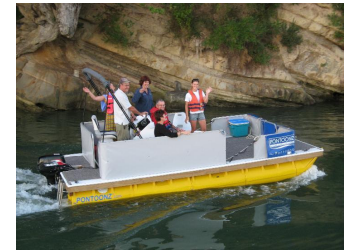
5.7 Metre Pontoon Boat. utilising Timber Beams. 30HP Suzuki Outboard

Copyright 2003-2009. All rights reserved worldwide by Pontoon Marine Systems Auckland New Zealand