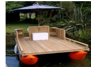
4.5 metre Utility barge utilising 6 x Main Pods & 2 x Bow Pods.