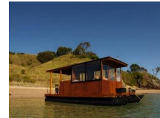
7 Metre Pontoonz Houseboat Timber construction