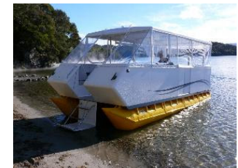
5.7 Metre Fusion Weekender professionally built to survey